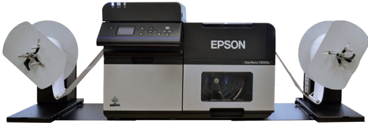
LABEL REWINDER (RW8000A) - Epson C8000 printer - LABEL UNWINDER (UW8000A) (Not included)

The Unwinding/Rewinding system for Epson C8000 Label Printer can handle media up to 127mm (5") wide and unwind/rewind label rolls having outside diameter up to 250mm (9.84").